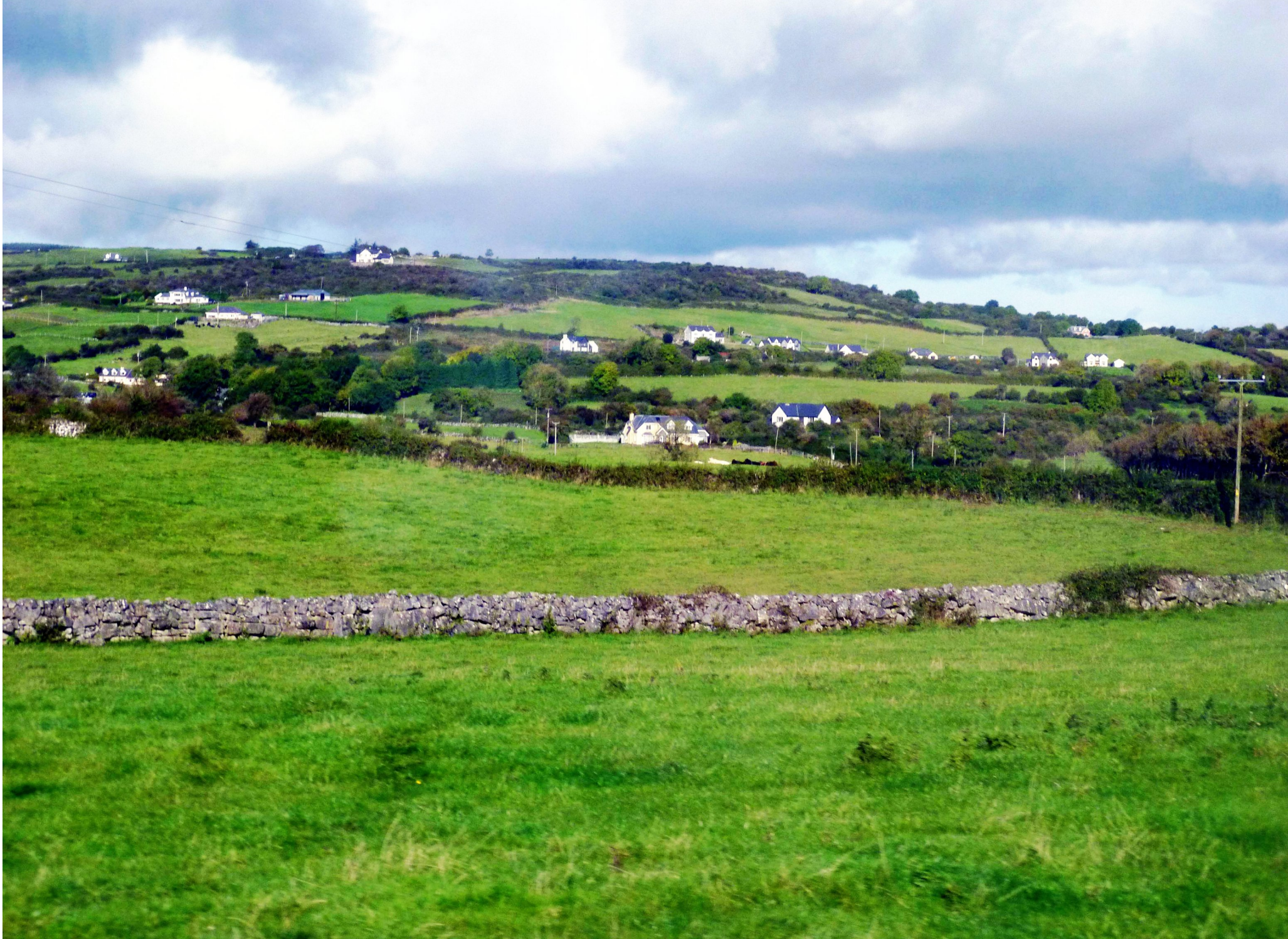
Central and Western Ireland