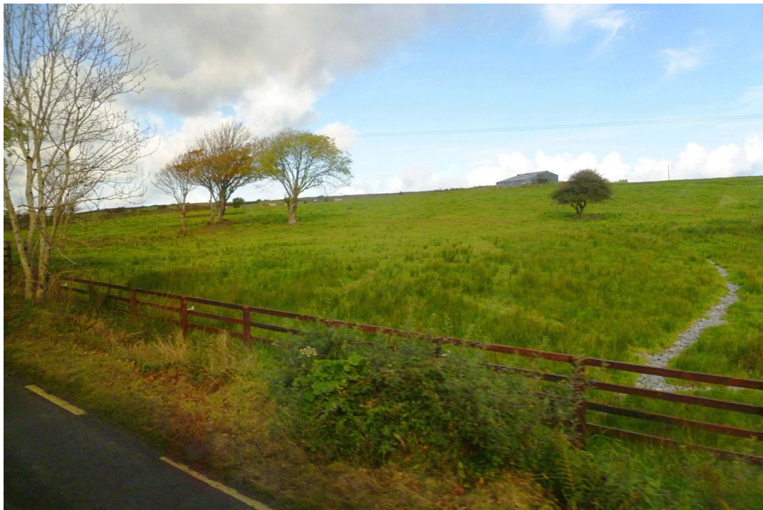
...and Dublin ...and Ireland