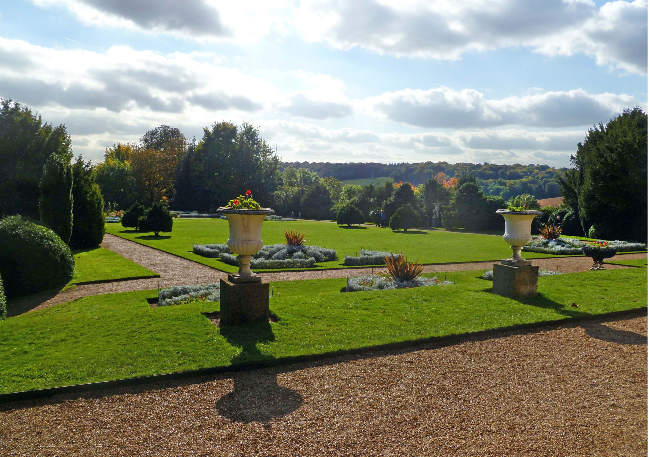
Hughenden Gardens, High Wycombe, England