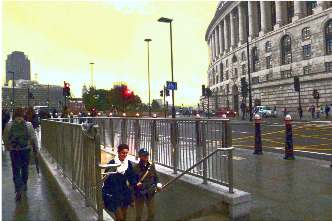
Prose and Poetry Travels to London